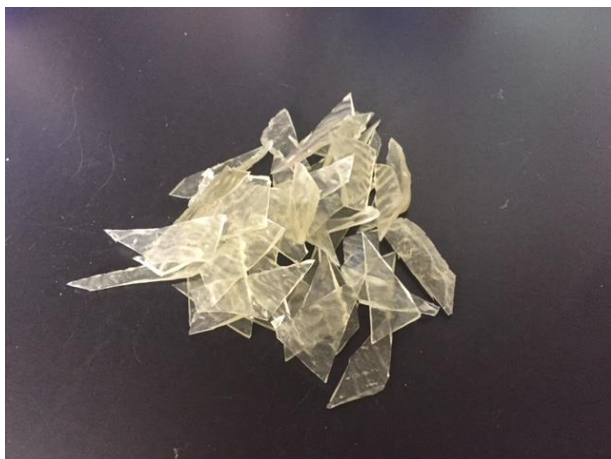
CNF composite PVC masterbatch